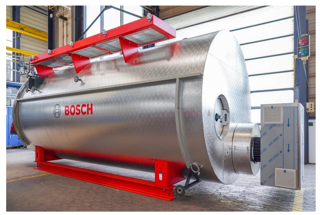
A Bosch hybrid boiler with an electric heater and burner system.