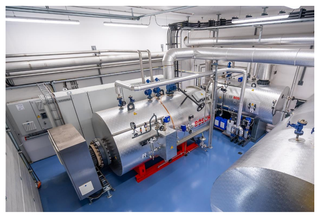
A Bosch electric steam boiler with system equipment.