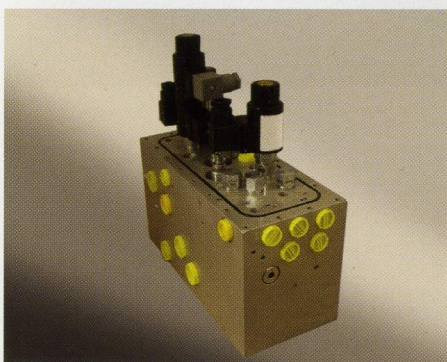
Figure 4: Subsea hydraulics: this block controls the drilling unit of a research ship which takes samples at depths of 2,500 metres.

With the new hydraulic system pressure build-up to initiate press movement is very rapid, despite the massive volumes of hydraulic oil moving round the system. The block also manages pre-charging and