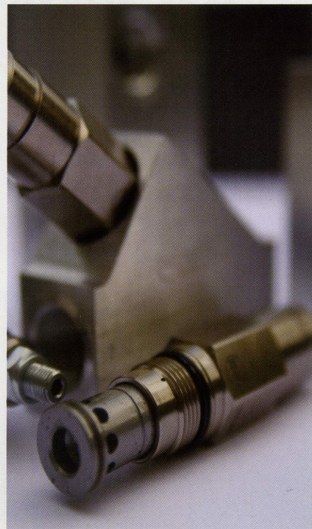
Figure 2: When it comes to selecting its screw-in valves, Ruppel Hydraulik has an unusually wide range at its disposal, so that special requirements can also be implemented in practical applications.

A typical project for mobile plant may involve the